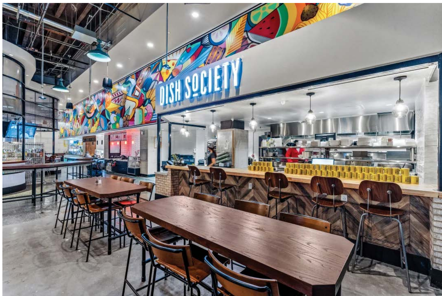
The new Dish Society at Finn Hall